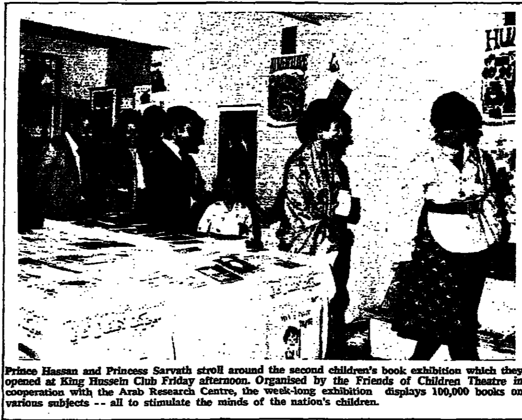
Prince Hassan and Princess Sarvath stroll around the second children's book exhibition which they opened at King Hussein Club Friday afternoon. Organised by the Friends of Children Theatre in cooperation with the Arab Research Centre, the week-long exhibition displays 100,000 books on various subjects -- all to stimulate the minds of the nation's children.

He suggested that journalists should visit agricultural projects to learn about development in this sector.